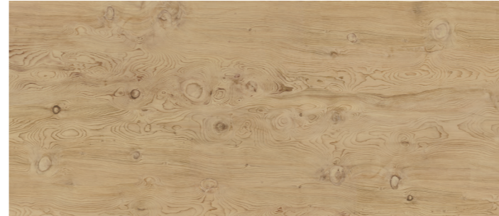
La Boheme 01

Thickness: 6mm Finish: Satin Code: NLIR0MOS6+ST Trade Price: $210 per square metre + GST Discounted Price: $115 per square metre + GST