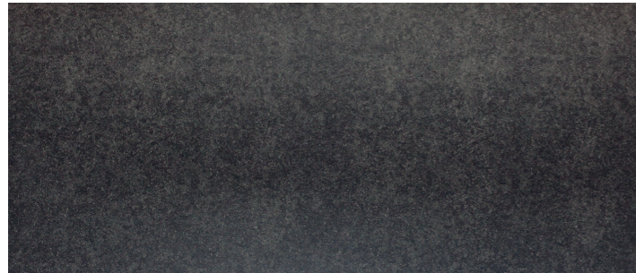
Belgian Blue Dark

Thickness: 12mm Finish: Satin Code: NLBARR012ST Trade Price: $220 per square metre + GST Discounted Price: $145 per square metre + GST