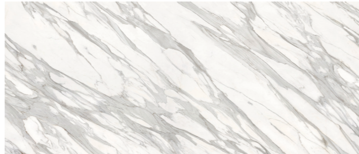
Calacatta Gold CG01R

Thickness: 12mm Finish: Silk Code: NLBELBLU12 Trade Price: Discontinued Discounted Price: $195 per square metre + GST